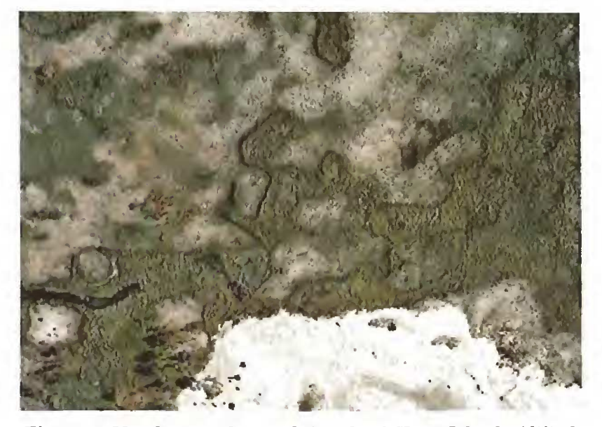
Figure 5. Marsh near the south beach of Horn Island. Altitude approximately 1,500 feet.